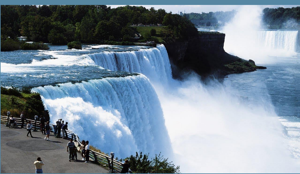
American View of Niagara Falls