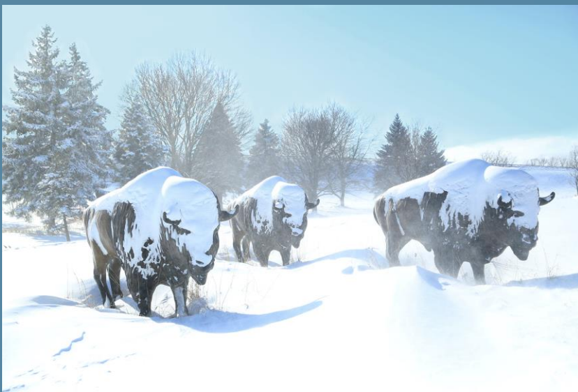
Winter in Buffalo