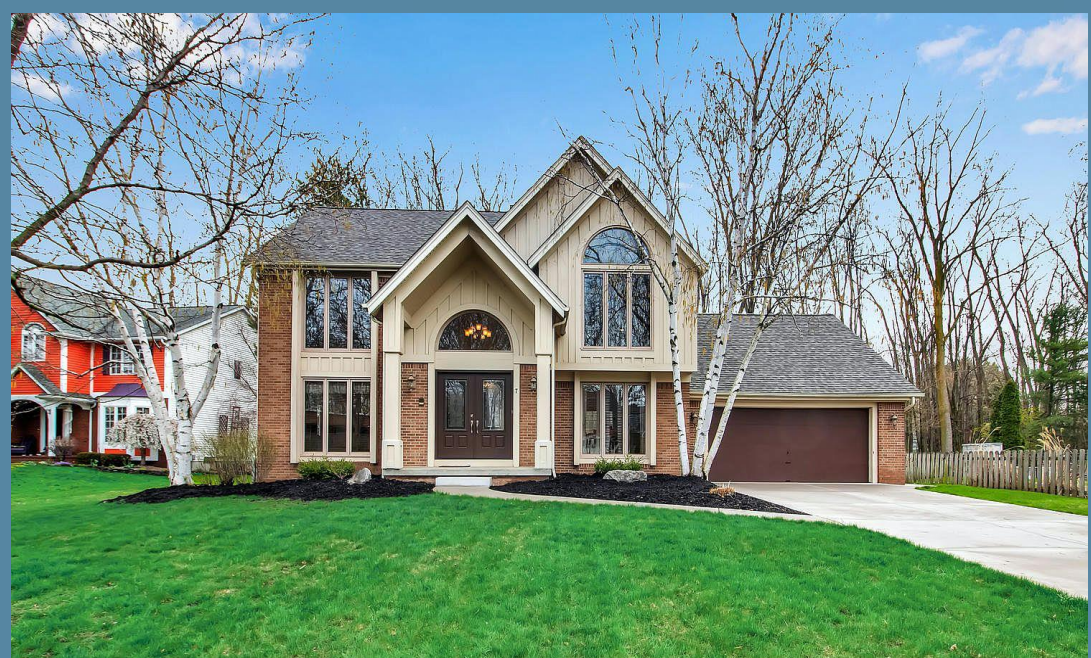
Typical house in Getzville, NY