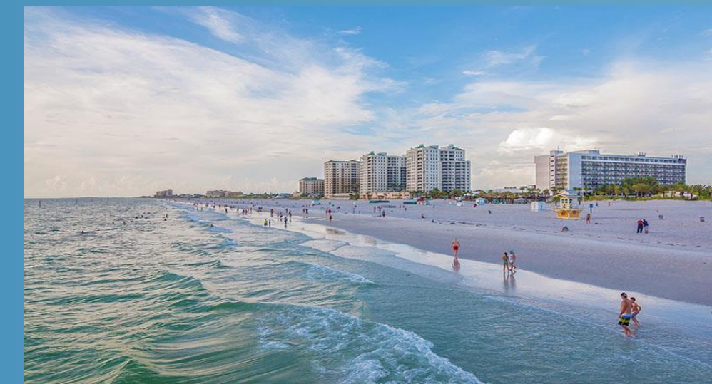
Clearwater Beach, voted America's #1 Beach