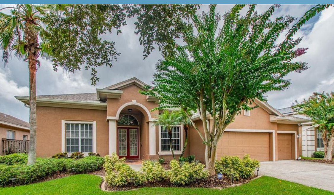
Typical house in Westchase, FL